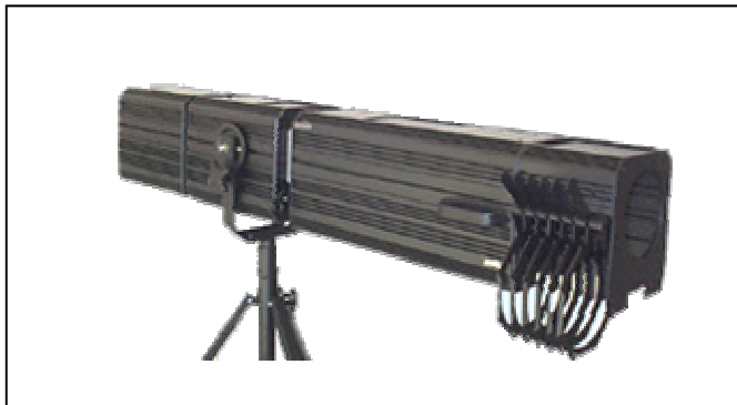
FS22-MSR - 1200W MSR/HSR